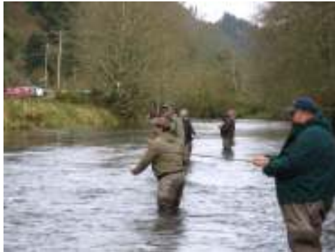
The Santiam Hog Line

The hog line was quite successful November 12th on the Miami when 16 Santiam Flycasters turned out for a beautiful day on the river. The rain held off until late afternoon, but by that time most were tending sore shoulders from fighting these dog tooth heavyweight Chum.