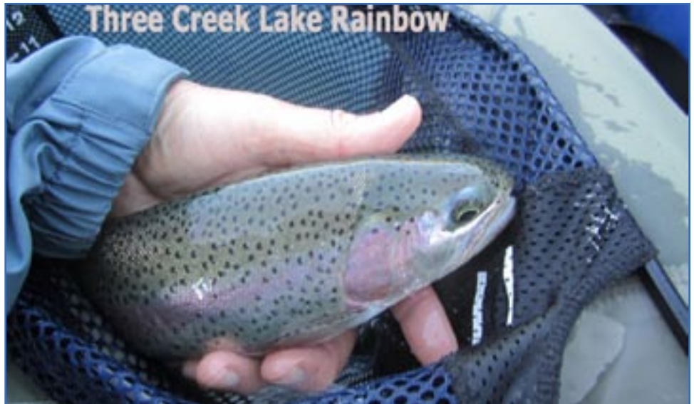
Fly of the Month Carey Special